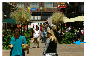
E. 4th Street Entertainment District

Conducted for Downtown Cleveland Alliance by Pedestrian Studies www.pedestrianstudies.com